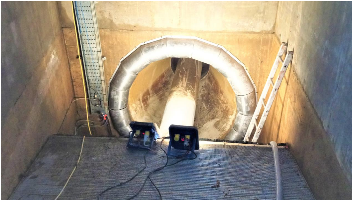
A view down a VETT venturi pipe, during installation. There are no moving parts, making it one of the safest designs on the market for fish.

The vast majority of water (80%) flows through the venturi pipe and encounters no moving parts, making it one of the safest fish-friendly designs on the market.