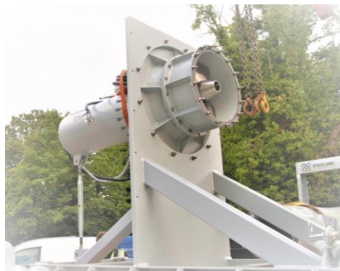
A VETT turbine-generator without draft tube during installation.