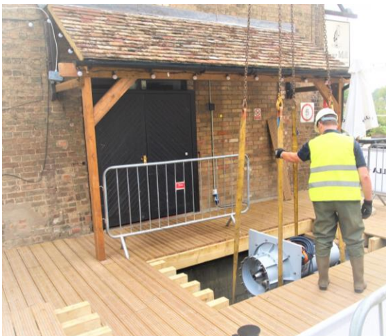
A VETT turbine during installation at Eaton Socon, Cambridgeshire in the UK.

This means the VETT is suitable for installation by historic or listed sites, in watercourses in areas of outstanding natural beauty or where fish safety is paramount.